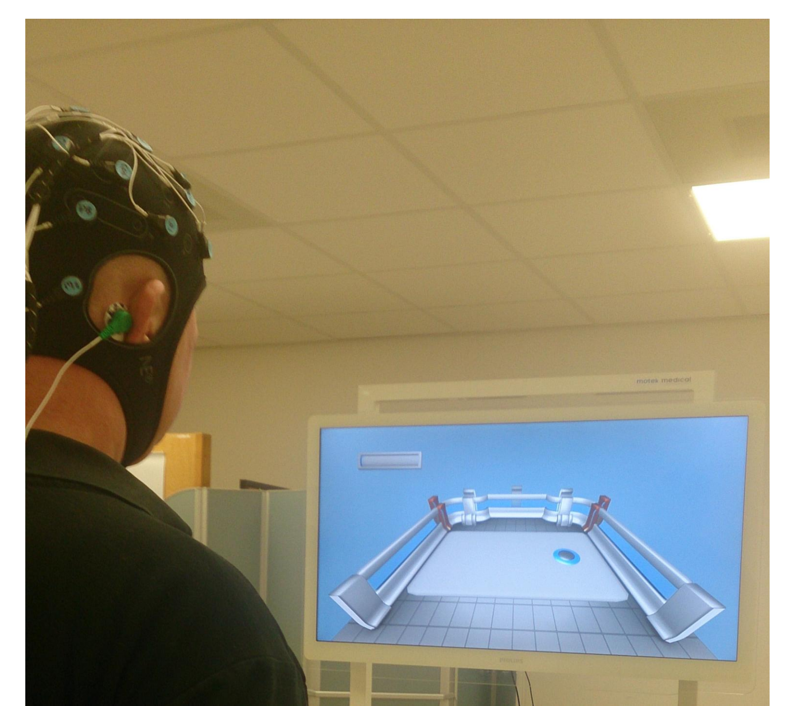
Fig. 1: the training task